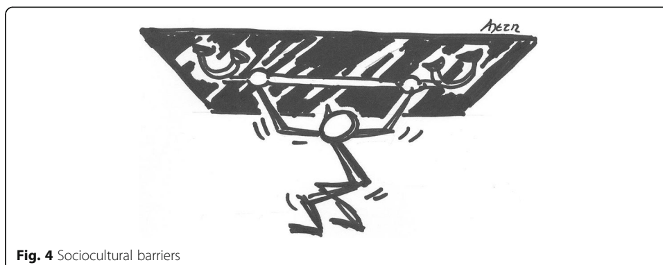
Fig. 4 Sociocultural barriers

Regarding these marginal contributions of women entrepreneurs, according to the findings, the percentage of registered businesses by women showed 71.3% against 28.7% that were unregistered; 79.3% of the 398 women entrepreneurs had 1–3 employees and 20.7% had 4–30 employees. Regarding the source of start-up capital, their husbands contributed the most (39.7%), followed by their own savings (33.2%), and only 0.5% received bank loans. The majority (79.1%) of the 398 women entrepreneurs were married, and 60.2% were between 29–43 years old. As regards their level of education, 61% attended primary school and vocational/training while those with a high school