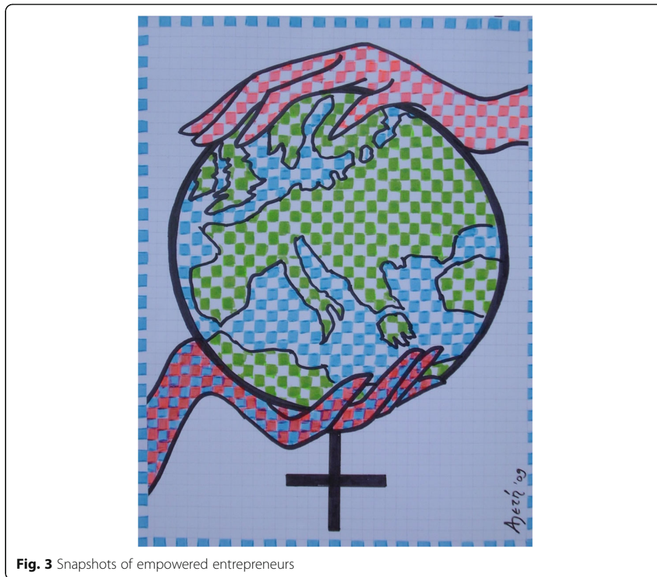
Fig. 3 Snapshots of empowered entrepreneurs

viewed as “a man-led activity and that is why it is not uncommon to find marginal contribution to business activity from womenfolk” (Nsengimana et al., 2018:152).